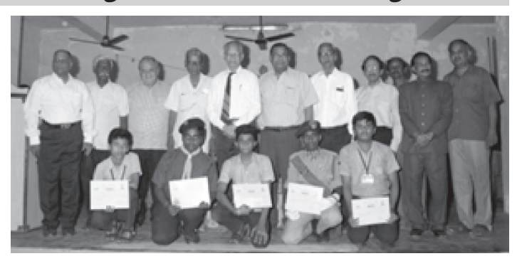
Management team of SCB and School with student recipients of the best awards from SCB